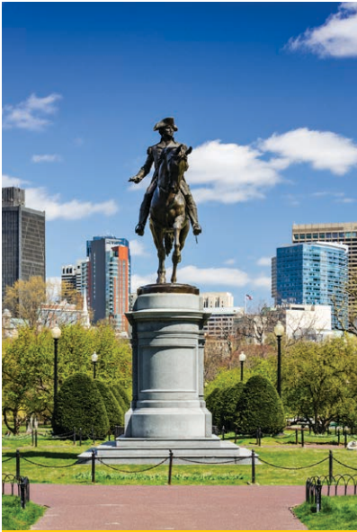
Boston Public Garden