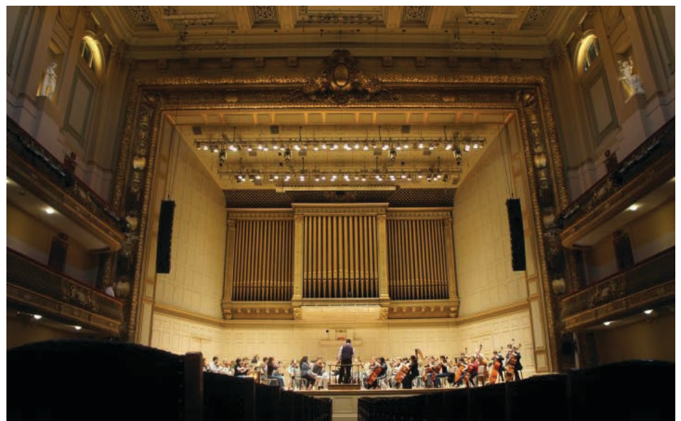
Boston Symphony Hall

In addition to its historic significance, Boston was also home to the Second New England School, made up of six composers whose music embodies American Classical music.